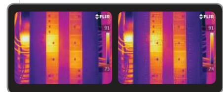
Original IR Image on the Left and with MSX™ Enhancement on the Right image (available on T440 model)